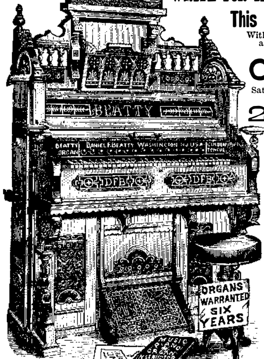
New Style No. 11000.—Dimensions: Height, 78 ins.; Depth, 26 ins.; Length, 49 ins.

REMIT by Money Order, Express Prepaid, Bank Draft or Registered Letter. Money refunded and all freight charges paid if not represented. Come to Washington, New Jersey, and see Factory. 3 acres of space within walls of building and select in person. Elegant carriage for visitors meets all trains.