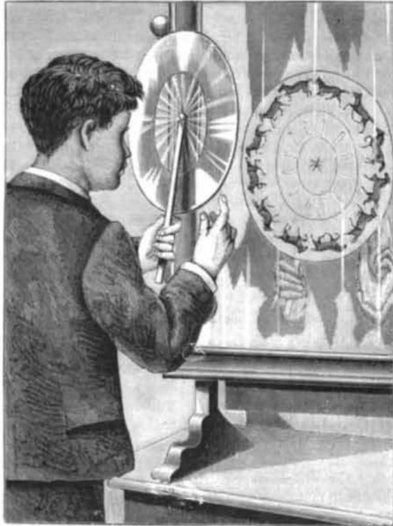
THE MAGIC WHEEL.

retained after the object is shut off by the intervening portion of the board between the slots until another horse