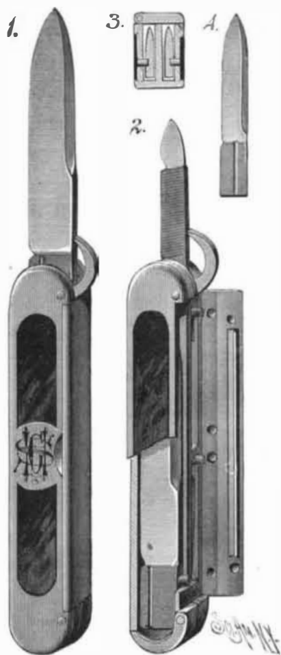
IMPROVED POCKET KNIFE.

In this knife there are no pivots in the blades, which in ordinary knives become loose and render the blades useless. No dirt can get in the knife, and the blades can always be