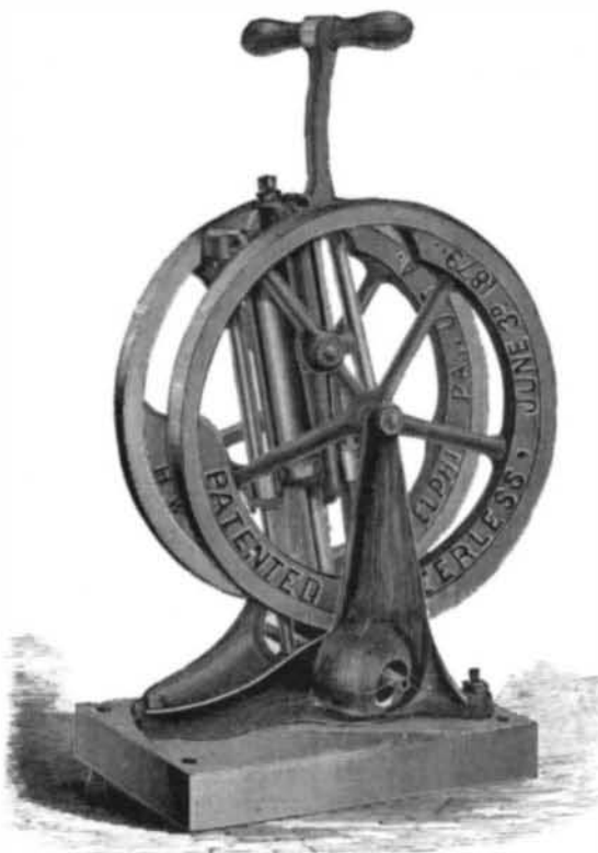
WEINDELL'S AIR AND GAS PUMP.

The illustration represents a powerful double-acting hand pump for air or gas lately brought out by Mr. H. Weindell, 405 N. Fourth street, Philadelphia. A smaller pump for air only