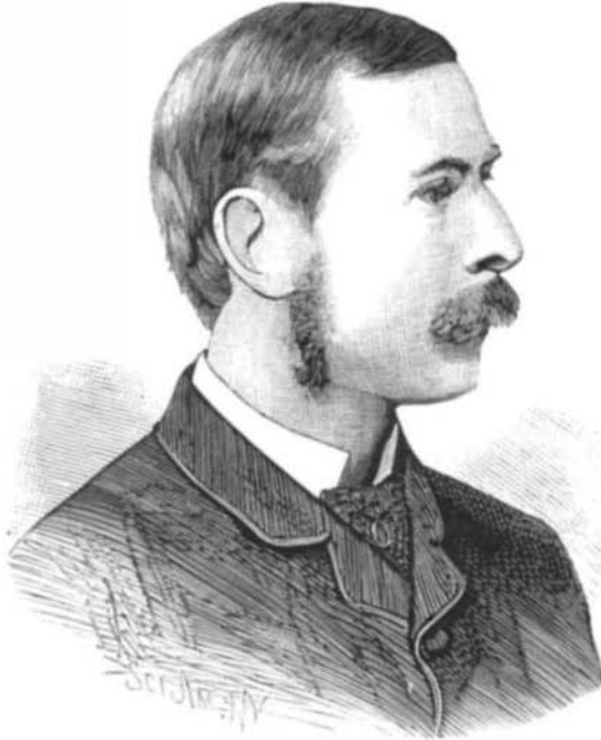
PROFESSOR W. H. M. CHRISTIE, F.R.S., The New Astronomer Royal.

Mr. William Henry Mahony Christie, who has succeeded Sir George Airy in the office of Astronomer Royal at the