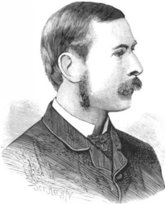
PROFESSOR W. H. M. CHRISTIE, F.R.S., The New Astronomer Royal.

Mr. William Henry Mahony Christie, who has succeeded Sir George Airy in the office of Astronomer Royal at the