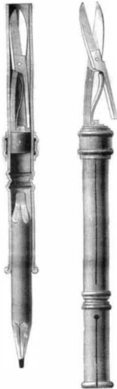
Benson's Combined Pencil Holder and Scissors.

A handy combination of pencil holder and scissors is shown in the annexed engraving. The pencil holder may be of any of the usual forms.