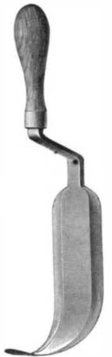
Turner's Hand Hoe.