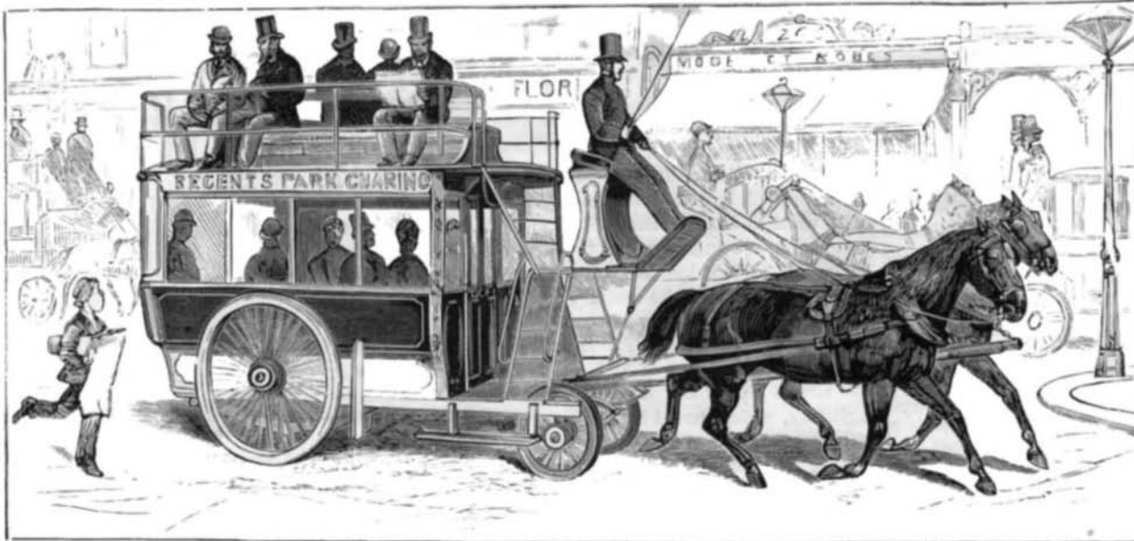
MOLESWORTH'S ROAD CAR.