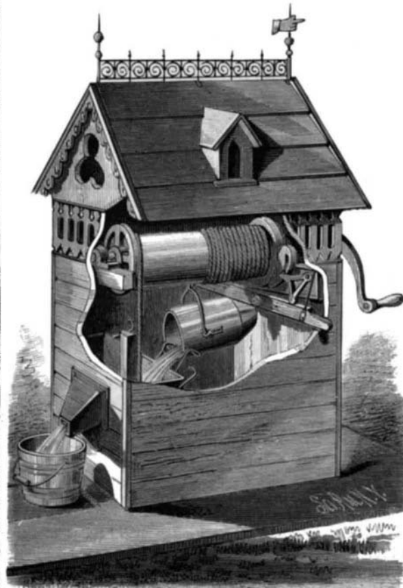
IMPROVED WATER ELEVATOR.

Although the devices that have been invented for elevating water are almost numberless, it must be admitted that there is nothing so free from objections as the old open