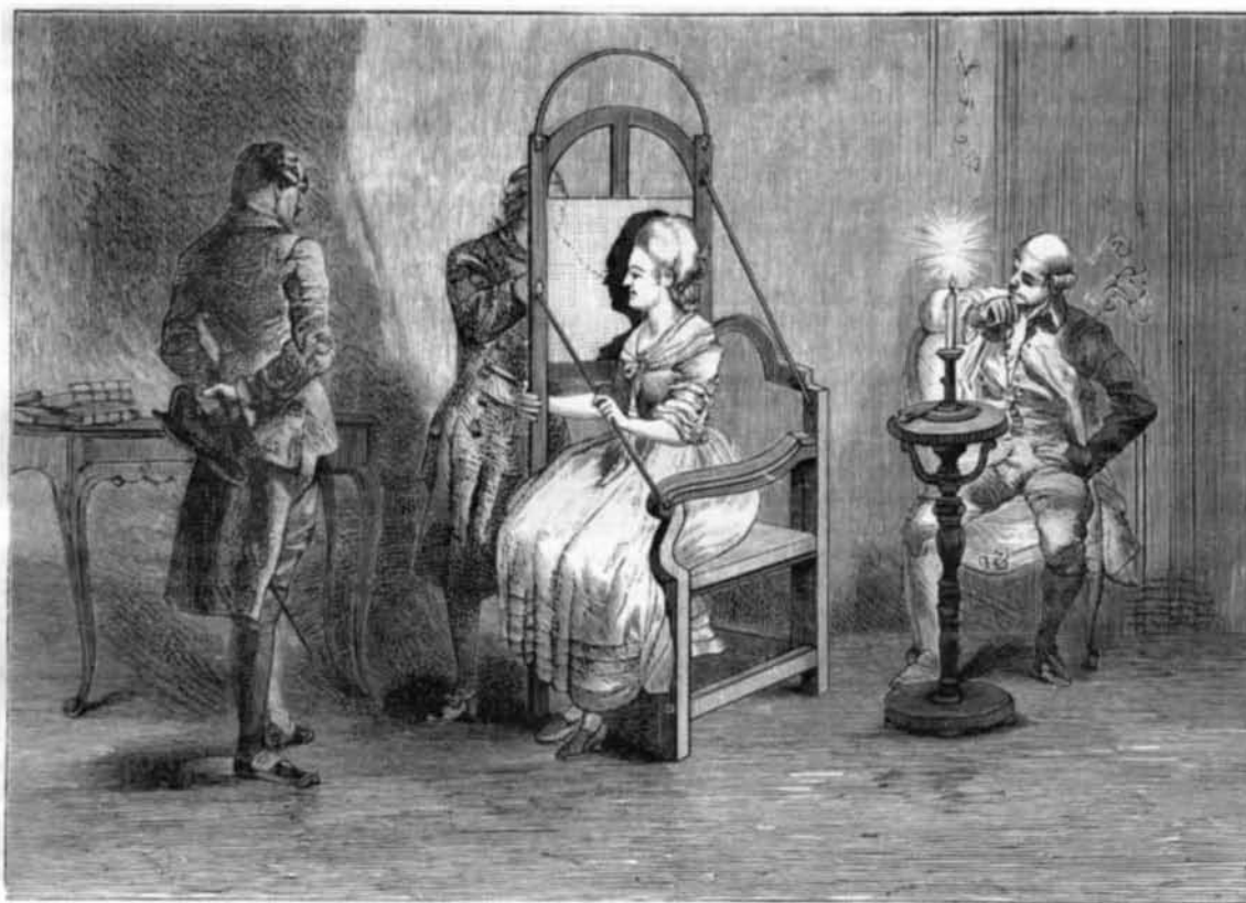
LAVATER'S APPARATUS FOR TAKING SILHOUETTES.—(From an ancient engraving of 1783.)

A stock car that can readily be adapted for transporting cattle or other stock, or mixed stock, and can easily be converted into an ordinary freight car, has been patented by Mr. Thomas Noble, of Todd's Point, Ill. The invention consists of an improved folding feed-trough and supporting braces, movable water-trough, adjustable shutter or feeding platform, and adjustable and removable stall gates.