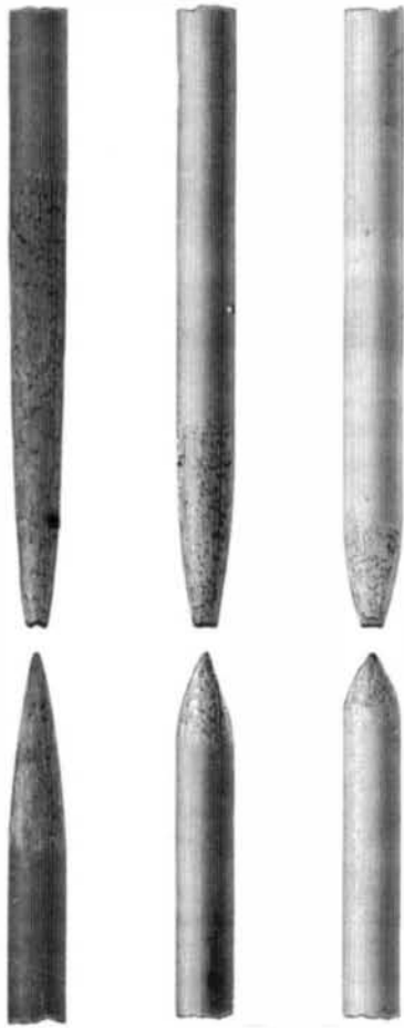
Fig. 1. Fig. 2. Fig. 3.

These experiments were made at the works of Lautter & Lemonier, using a Gramme machine of the type of 1876, and burning Carré carbons. The positive carbons covered with copper gave a very good shape, and an excellent one when covered with nickel; with the negative carbon the shape was