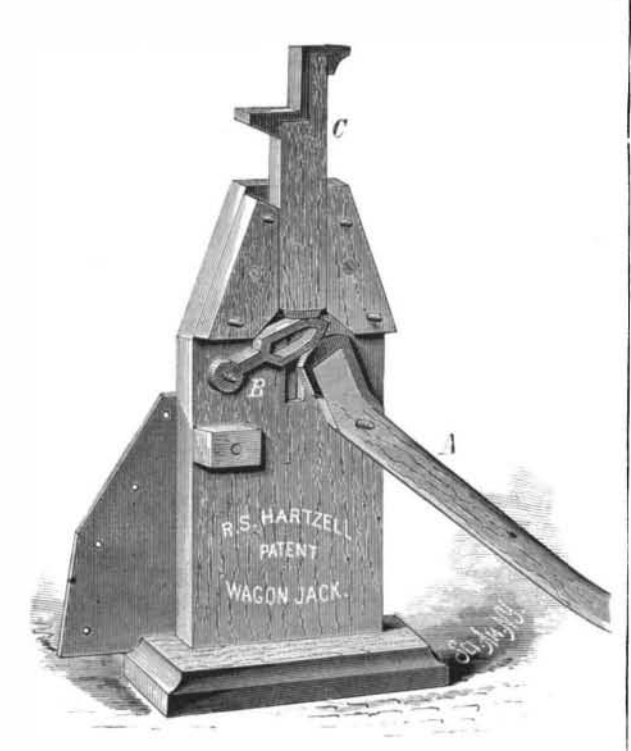
NEW WAGON JACK.

We give herewith an engraving of a very simple and inexpensive wagon jack, which has lately been patented and is being manufactured and introduced by Messrs. R. S. Hartzell & Co., No. 235 South Third street, Philadelphia, Pa. The cut shows the jack with one side removed to show the internal construction. The lifting device consists of follower, C. These parts are arranged in relation to each other, so that when the lever, A, is pressed down the fol-