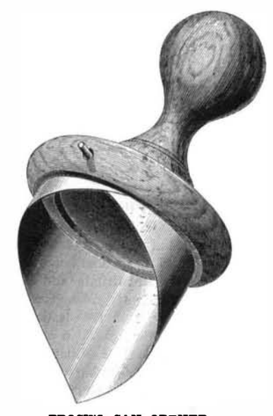
BROCK'S CAN OPENER.

The method of using this instrument is obvious. The penetrating point is forced through the top of the can near