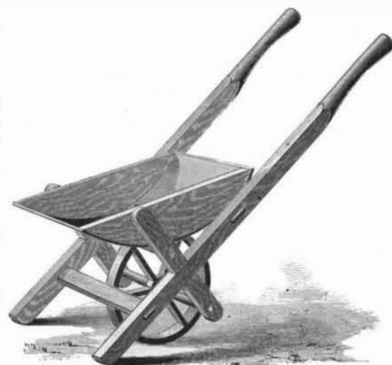
KINCANNON'S IMPROVED WHEELBARROW.

The engraving represents an improvement in the class of wheelbarrows whose body is pivoted to adapt it to dump its contents by tilting or turning on its pivots. The improve-