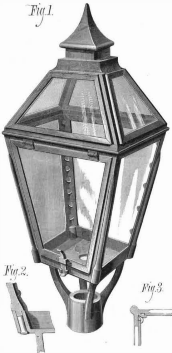
STEWART'S STREET LAMP.

The socket fitting the lamppost and the base plate of the lamp frame are made in one casting, and the sides of the base plate are provided with flaring flanges having at the corners sockets for receiving the malleable iron corner pieces which are fastened by riveting, as shown in Fig. 2, which represents a portion of one of the corners in section.