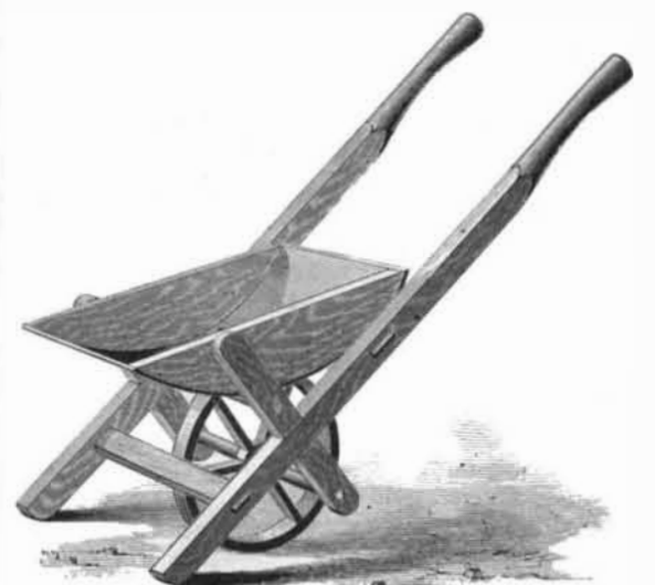
KINCANNON'S IMPROVED WHEELBARROW.

The engraving represents an improvement in the class of wheelbarrows whose body is pivoted to adapt it to dump its contents by tilting or turning on its pivots. The improve-