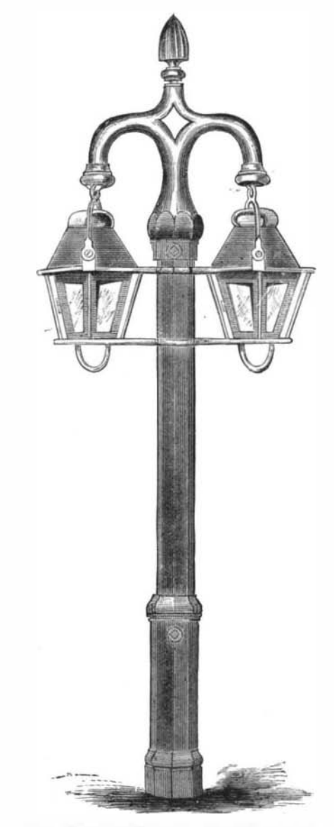
BURTON'S IMPROVED STREET LAMP.

chains; these chains extend into the base, where their inner