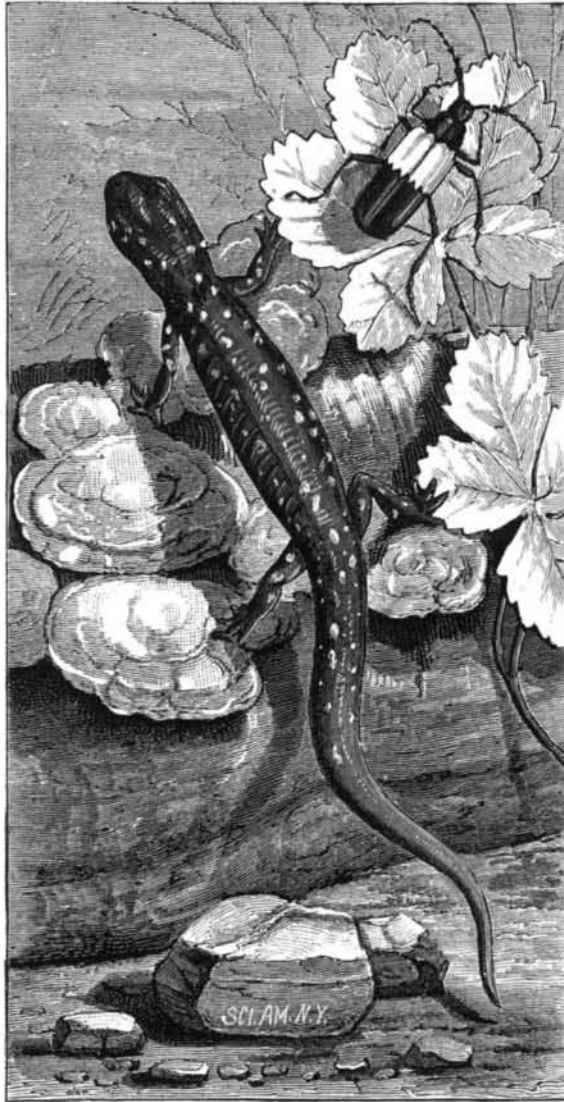
THE GLUTINOUS SALAMANDER.—( Plethodon glutinosus , Baird.)

This batrachian ( Plethodon glutinosus (Green), Baird), which is known by some authors as the viscid salamander, can be distinguished from our other salamanders by the following characteristics: Head oblong, not as broad, short, and rounded in front as in the amblystomas; form rather robust for the genus (the amblystomas are generally much stouter); tail cylindrical; limbs short and rather stout, with the inner toes small, but distinct. There are 14 folds in the