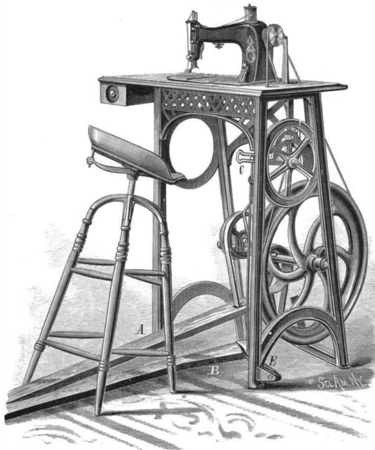
VAN WYCK'S TREADLE ATTACHMENT FOR SEWING MACHINES.

the action of the different acids, and under a pressure of from thirty to seventy pounds per square inch, iridescent, nacreous, or similar effects, resulting from the decomposition of the glass, are obtained. If among other reactions, under a pressure of from thirty to seventy pounds, water acidulated with hydrochloric acid in the proportion of fifteen per cent of acid is employed, nacreous and iridescent effects resembling those of ordinary mother-of-pearl, or nacre, are obtained. It is said that the same effect can be produced without pressure. The applications of this process are numerous, and include the production of nacre, the