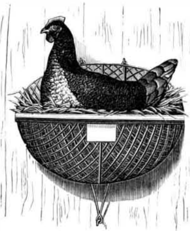
IMPROVED HEN'S NEST.

It is a well known fact that straw or hay nests or basket nets for setting hens cannot be kept free of vermin. The