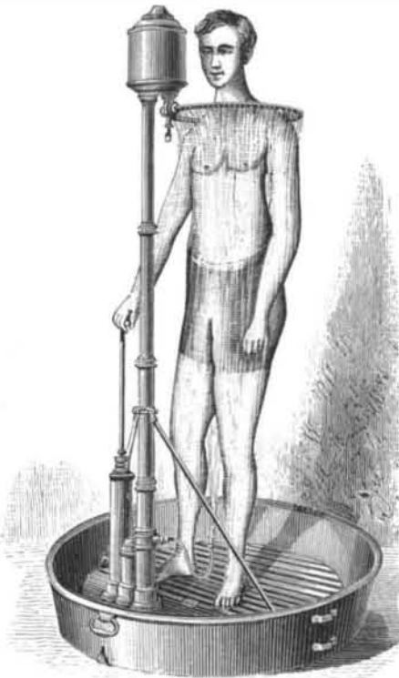
Fig. 1.—HYDRO-THERAPEUTIC APPARATUS IN OPERATION.

The annexed cuts, which we take from La Nature , represent a simple, practical, and compact shower bath, or hydro-