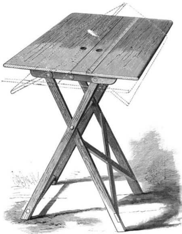
FREEBORN' FOLDING STAND.