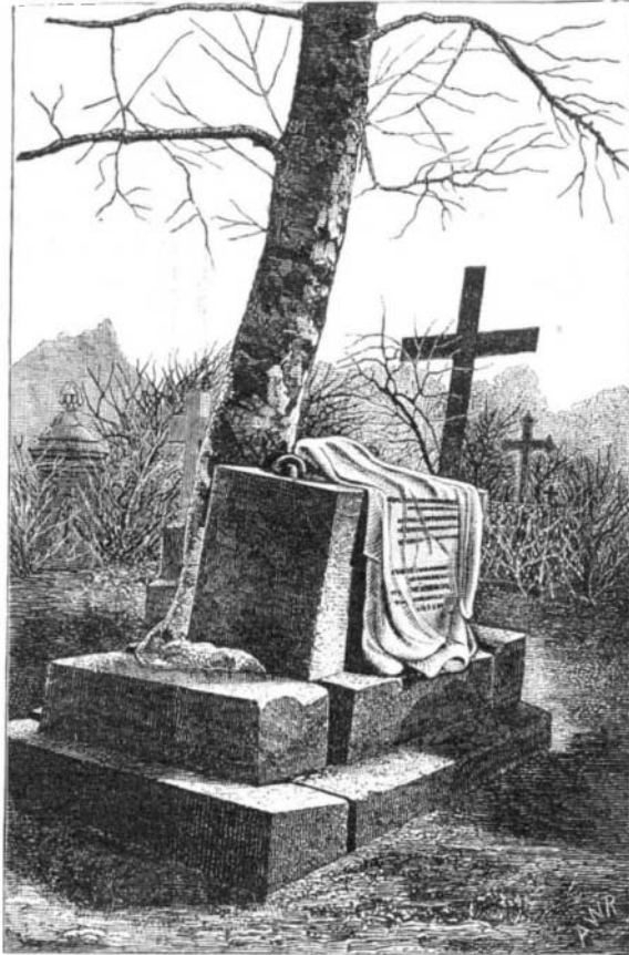
THE FORCE OF TREE GROWTH.

The disruptive power of tree roots, growing in the crevices of rocks, is well known. Masses of stone weighing many