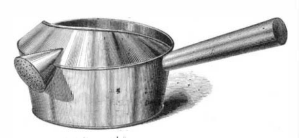
HARRISON'S WATERING DIPPER.

A convenient vessel for watering plants, sprinkling floors, and for other similar purposes is shown in the annexed engraving. It is simply a dipper of the usual form, partly covered at the top by a shield, at the center of which is fixed a sprinkler spout. The utility of this improvement will be ferably made of glass or earthenware, and is provided