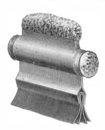
SMITH'S SLATE WASHER.

Few articles meet with a readier sale or more promptly remunerate the inventor than the class of inventions adapted to the use of children either in their school life or in their amusements. One of these useful little novelties is shown in our engraving. It is a slate washer, consisting of two