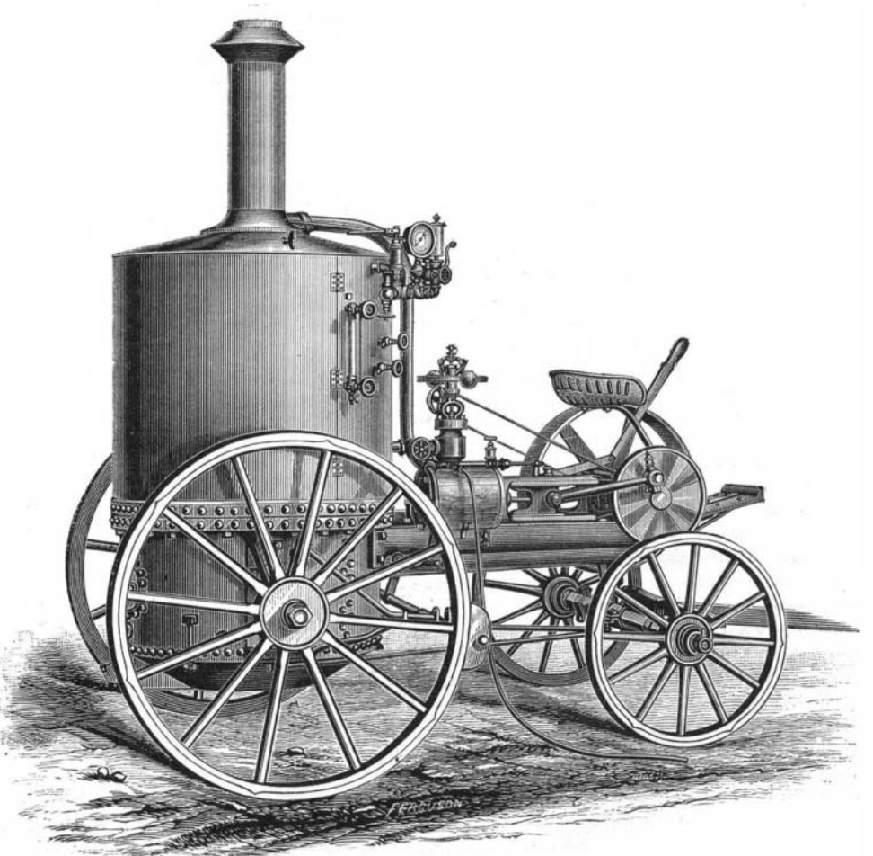
THE NEW WESTINGHOUSE AGRICULTURAL ENGINE.

Mr. John W. Fields, of Sherman, Texas, has invented a device for supplying water and air to the face and land side of a mould board, to prevent the earth from adhering to them. It consists in perforating the mould board and land side with small holes, and attaching to the back of the mould board a water reservoir and a piston and pump or other device for forcing water and air through the perforations, so as to lubricate the faces of the plow, and thus prevent the adhesion thereto of earth.