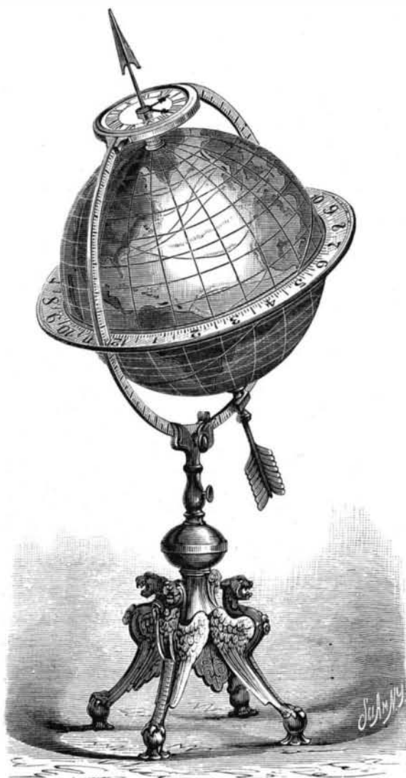
JUVET'S TIME GLOBE.

For many years it has been the ambition of horologists to apply by some mechanical device a motor to a terrestrial