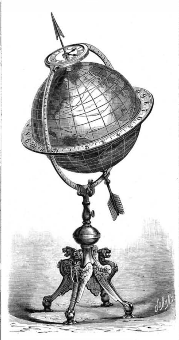
JUVET'S TIME GLOBE,

For many years it has been the ambition of horologists to apply by some mechanical device a motor to a terrestrial