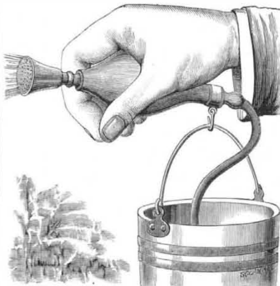
SCHRADER'S PLANT SPRINKLER.

The invention shown in the annexed engraving will be appreciated by lovers of flowers and plants, as it affords a