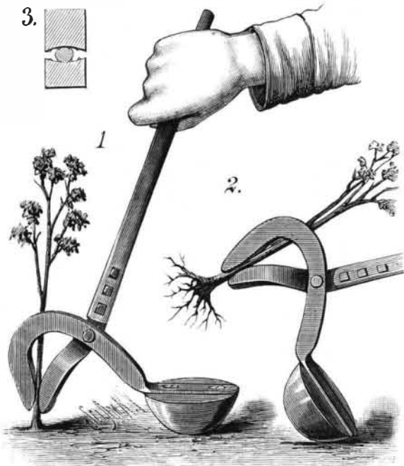
SNAPP'S SPROUT PULLER.

Sprout or grub pullers, as commonly made, have sharp jaws, which are liable to cut or break the sprout, and they are otherwise inefficient and inconvenient. The annexed