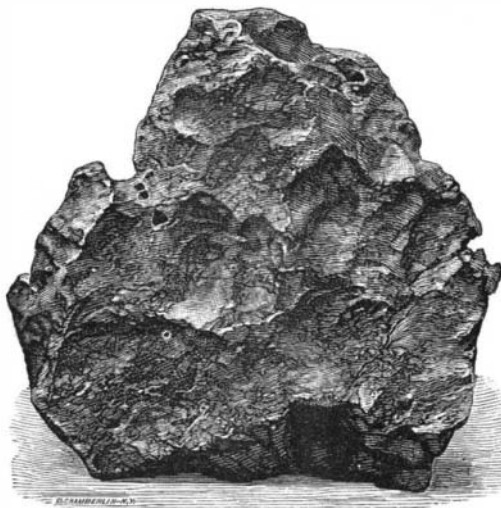
Meteorite from Chulafinne, Ala.