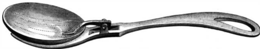
NOTT'S COMBINED FORK AND SPOON.