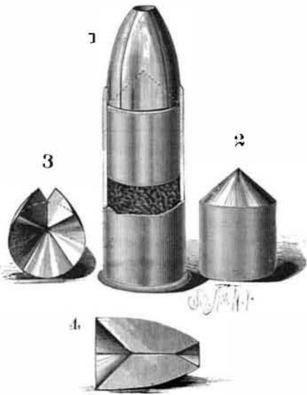
RICE'S IMPROVED PROJECTILE.

The annexed engraving shows a sectional projectile recently patented by Mr. I. L. G. Rice, of Cambridge, Mass. It consists of a main bullet having a conical end, and placed wholly within the cartridge shell, with its conical end pointing outward, and a sectional bullet composed of several parts, held in place by the cartridge shell. The sectional portion has a conical cavity adapted to the conical end of the main bullet, and there is a conical aperture in the outer end of the sectional bullet to allow the air to act upon the sections to separate them after they are discharged from the firearm.