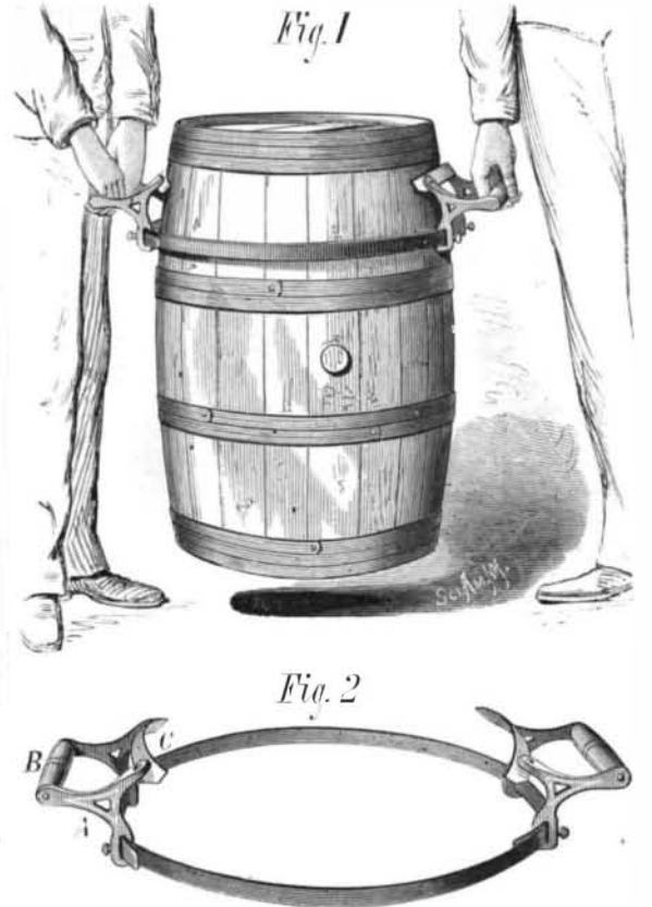
BROWN'S BARREL LIFTER.

It is difficult to conceive of a more ungainly and inconvenient object to handle than a common barrel. It is very well calculated for rolling about on a level surface, but when it is desired to lift it from one level to another, as from the ground into a wagon, for example, or carrying it up and down steps or stairs and through narrow passages, it is quite a difficult matter.