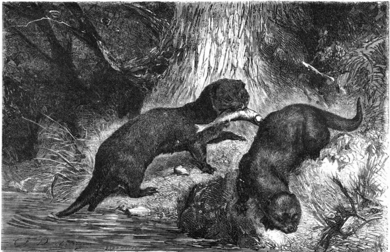
THE OTTER.—Lutra Vulgaris.

The manner of applying the lifter will be clearly understood by referring to Fig. 1 in the engraving. An upward strain upon the handles puts a lateral strain upon the hoop, and brings the curved bars, C, against the side of the barrel with sufficient force to admit of lifting it by the handles. A patent is pending for this invention in the United States Patent Office. Further information may be obtained by addressing the inventor as above.