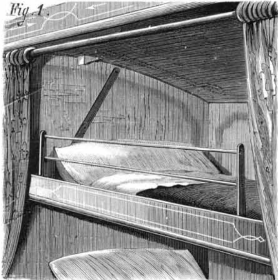
HILLS' SLEEPING-CAR BERTH.

The annexed engravings represent a novel guard for sleeping-car berths, recently patented by Mr. Frederick C. Hills, of Missouri Valley, Iowa. It is intended to prevent sleepers from rolling out of the upper berths of cars and vessels, and to prevent car berths from closing up and shutting the occupant in, in case of accidents. Fig. 1 is a perspective view of a berth ready for occupancy, and Fig. 2 is a transverse section, showing the bed in different positions. The berth, A, is hinged in the usual way, and supported at each end by a jointed and pivoted link, B, which permits of closing it when the berth is not in use. To the front of the berth is