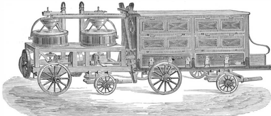
FIG. 2.—PORTABLE MILL.

division after each channel is completed, the next channel is then produced by the return motion of the carriage. By turning the object slowly in the lathe, simultaneously with the revolving and traversing motion of the cutter, helicoidal channels or grooves are formed. For grooving conical parts, the cutter shaft is guided along an inclined guide pattern, or its axis is placed at an angle to the longitudinal axis of the lathe. The cutter adjusts itself to the shape of the object, and carves, by its uniform forward motion, an ornamental