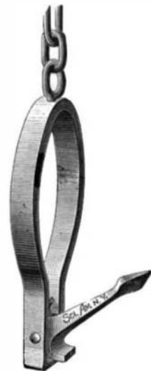
A Novel Anchor.

The engraving represents an improved anchor recently patented by Messrs. Spedden & Stafford, of Astoria, Oregon. It consists in a single fluke pivoted in a frame and provided with cam-shaped tripping arms at its base. The frame or shank serves both as a shank and stock, and it has no projecting arms to entangle the cable or chains so as to foul it, and its action is rendered positive by the action of the trip arms.