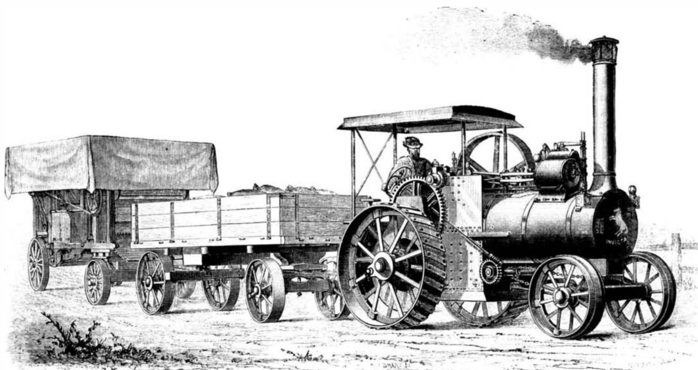
AVELING & PORTER'S ROAD AND FARM LOCOMOTIVE AND TRAIN.