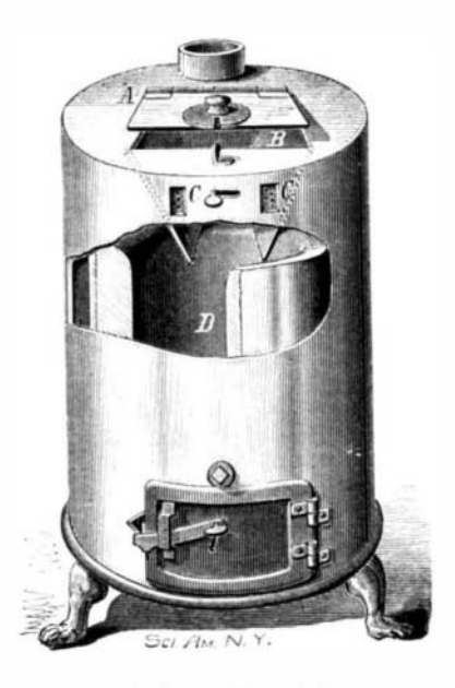
RICE'S CAR STOVE.

The door, A, through which the fuel is introduced at the top of the stove, is provided with a fastener consisting of a notched disk which is engaged by a hook on the stove top. Below the door, A, there are two doors, B, which are kept open by their own weight, and will close automatically so as to prevent the escape of fire should the stove through accident become inverted. The draught holes which are covered by the damper, C, are provided with a perforated metal covering which prevents the escape of coals. The fire pot, D, is placed a few inches from the top of the stove, and below it there is an ash pit which is tightly closed by the door near the bottom of the stove.