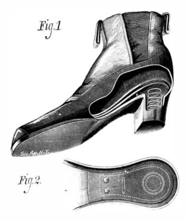
PEASE'S SPRING BOOT HEEL.

In the heel is formed a cavity for receiving a spiral or rubber spring, and a stout leather plate or flap is secured to the narrower portion of the sole and extends backward over the spring. A metallic plate is fastened to the under surface of the leather flap, and rests upon a cross bar that projects a