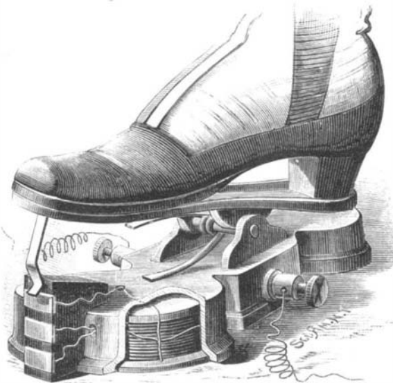
HUSSEY'S SWITCH PEDAL FOR CONTROLLING ELECTRIC MOTORS.