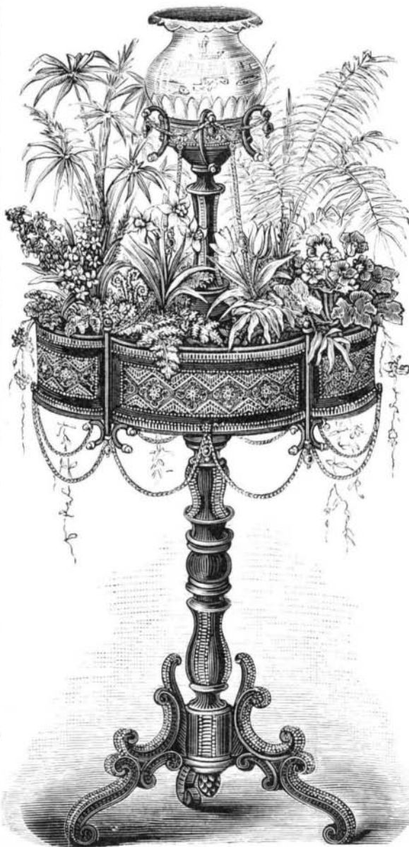
THE WINDOW GARDEN.

Nothing adds more to the cheerful appearance of the interior of a house than an array of choice plants, but too frequently it happens that the hideous red pots containing them are permitted to stand out in bold relief, entirely neutraliz-