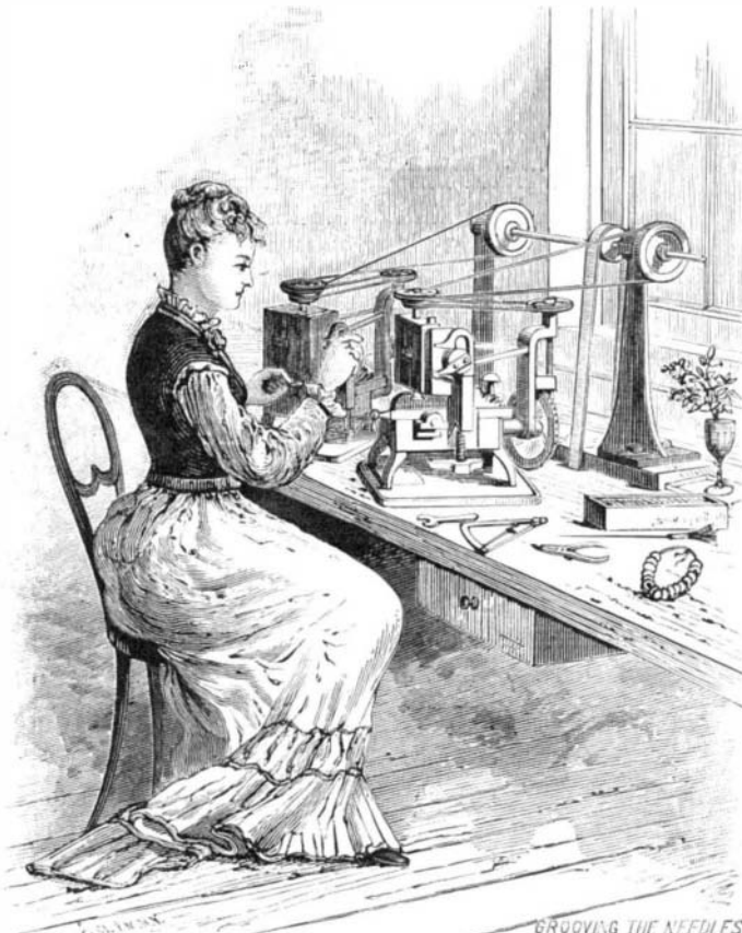
SEWING MACHINE MANUFACTURE.

They recommend a reduction of the gauge to 1 meter (3 feet 3 3/8 inches), and in some instances even to 75 centimeters, 3/4 of a meter (2 feet 6 inches), whereas in England a 3 foot gauge is preferred. They advise the dispensing with fences except at especially dangerous points and near dwellings; that the stations should consist merely of a waiting room, ticket office, and station master's lodgings; that the cars should be of two classes, with possibly an upper story; that they should be without useless ornamentation; and that the rolling stock should be at a minimum—in fact, that everything should be arranged with a view to strict economy. Under these conditions they estimate the cost of the roads, per mile, at an average of about $22,000. They put th