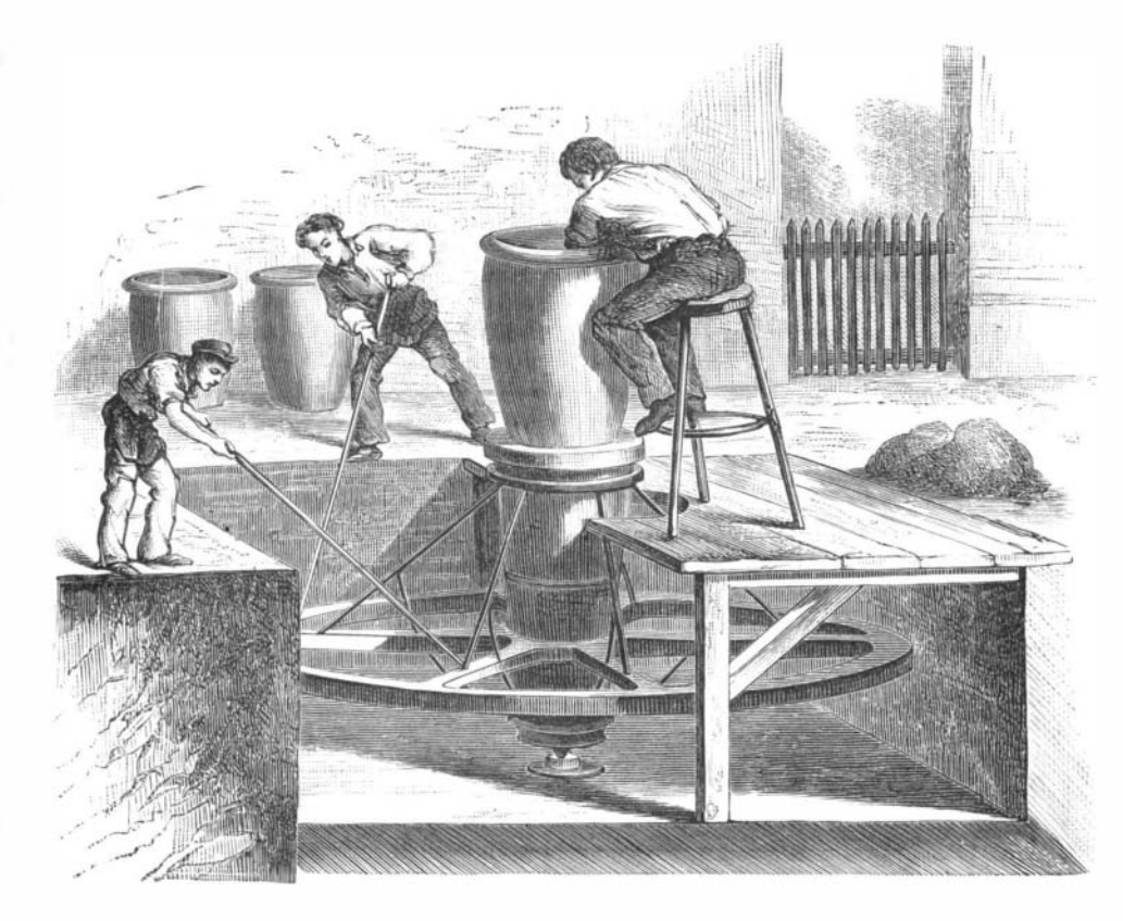
Fig. 1.—POTTER'S WHEEL.

be further improved in quality. Previous to use it is thoroughly kneaded with the feet and divided into portions of The word "faience" is now generally used to designate about 50 lbs. each, which are distributed among the formers Sifers, of La Cygne, Kansas, will, when opened, catch the