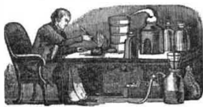
For the Scientific American. Poisonous Metals.—Lead.