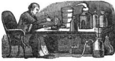
For the Scientific American. Poisonous Metals.—Lead.