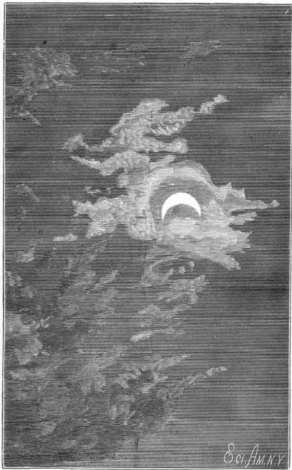
Fig. 1, a copy of a photograph taken at Indianapolis, Ind.,