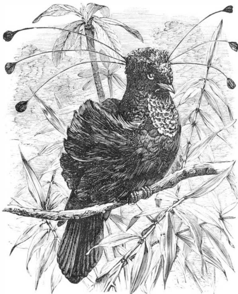
GOLDEN BIRD OF PARADISE.