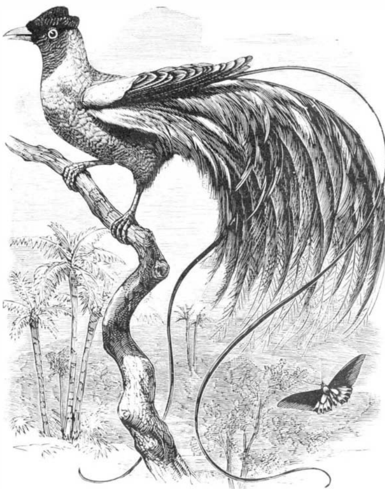
RED BIRD OF PARADISE.