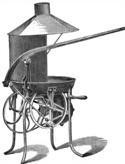
THE BUFFALO FORGE.

The machinery is all attached to the hearth, and not to the legs, which makes it very compact. The legs are wrought iron pipe, and are screwed firmly into cast iron sockets projecting from the hearth. The working parts being entirely under the hearth, they are not liable to get wet if exposed to the rain or snow when used in the open air. There is no dead center to overcome when starting up, and it is impossible to revolve the fan backward. The journals are all Bab-bitted. It is not necessary to fill the hearth with fire clay to prevent the working parts from getting hot, but it can be