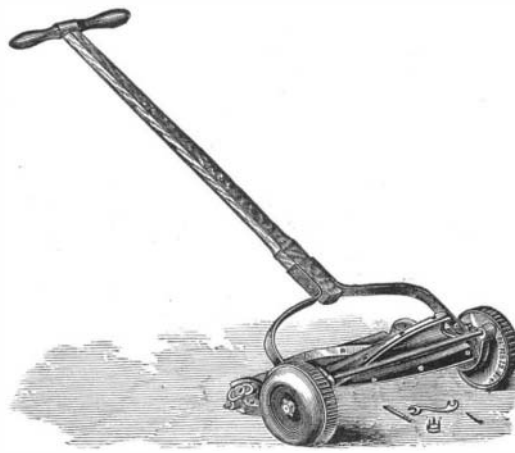
THE PHILADELPHIA LAWN MOWER.—Fig. 1.

We illustrate herewith two forms of an improved lawn mower, which is claimed to run easily, work efficiently, and to be strongly and durably constructed. Fig. 1 represents the 6½ inch driving wheel machine, of which five sizes are made, suitable for large and small lawns. The construction will be readily understood from the engraving. Fig. 2 is a new 15 inch mower, with 8½ inch driving wheels, and 6½ inch wiper or revolving knife cylinder. It weighs 51 lbs.,