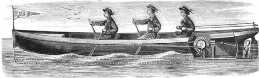
NEW BOAT-PROPELLING DEVICE.

The ram can be used, we are informed, on any fall of water, from sixteen inches upwards, and is guaranteed to convey one fifth of the water passing into it, a distance of one hundred rods, and to discharge it at an elevation twelve times higher than that existing between source and machine. Or a greater percentage of water can be raised to a less height. The apparatus is in successful use in many localities, and is especially adapted for use on farms, or in cities for elevating water to the top of high buildings.