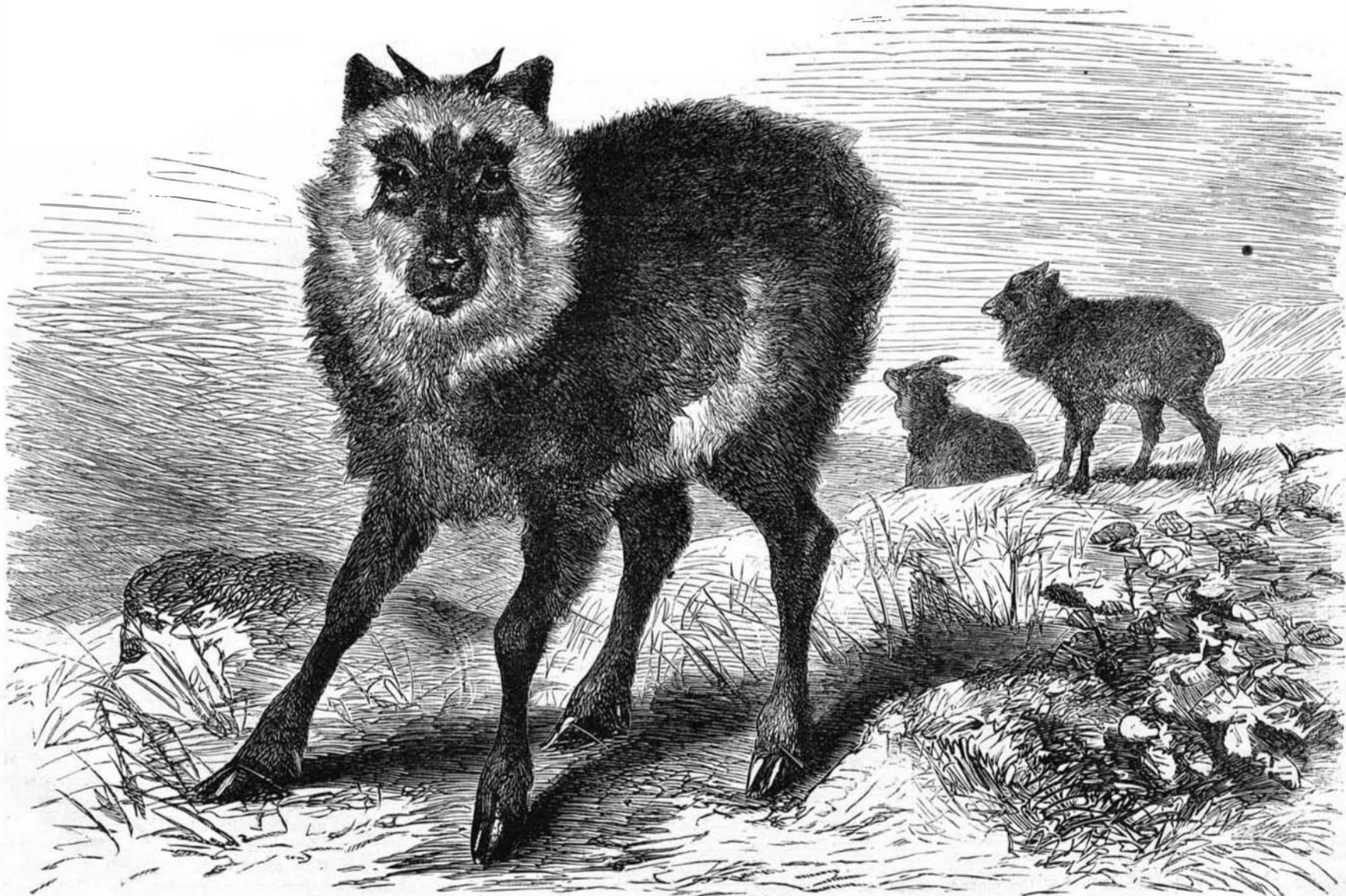
THE CURLY-HAIRED ANTELOPE.—(JAPANESE CHAMOIS).

Very little is known of this antelope in its wild state. Siebold, in his "Fauna Japonica," calls it antelope crèssue , and mentions that it is known to the Japanese by the name of "Nik," but that it is rarely found, and only then in the highest mountains of the Island of Nippon and Sikok. The appearance of the animal would indicate that it is a hardy inhabitant of a mountainous country.